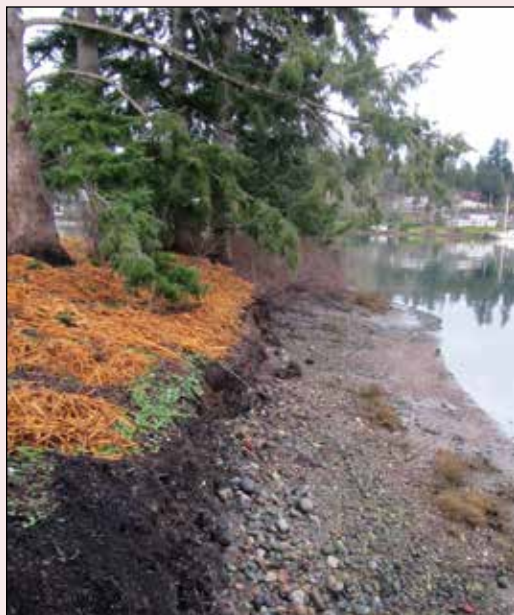
With the Powells' bulkheads gone, native forest plants take root above and pickleweed and other intertidal plants emerge below.

Kehers says family members are delighted with the outcome, and even one brother who doubted the project now grudgingly concedes its success. Carman publicly touts it as "a great example of complexity and collaboration." Following its completion, "I gave a presentation to our habitat program quarterly meeting in Olympia. I used the Powel project as a positive example of what we can do — after all the dire reports, here's a good one!"